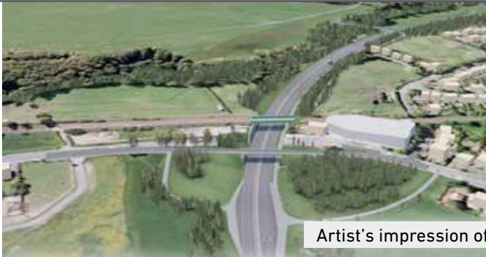
Artist's impression of the proposed scheme